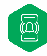
Remote Alarm Contact