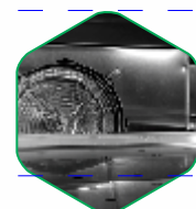
Forced air circulation for uniform distribution