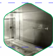
High Quality PT100 Temperature sensor